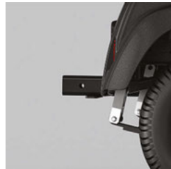
Rear Receiver Hitch