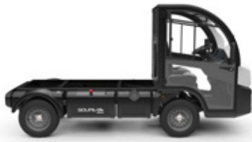
G4-01 CHASSIS CAB