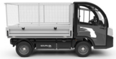
G4-03 PICK-UP CAGE BODY