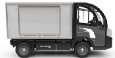
G4-06 VAN BODY