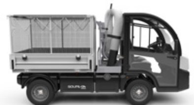
G4-09 COMBINED PICK-UP CAGE BODY WITH LEAF COLLECTOR