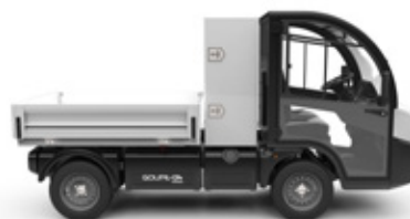
G4-08 COMBINED PICK-UP WITH TOOLBOX