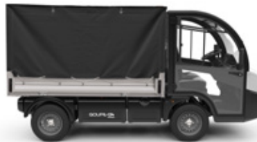
G4-05 PICK-UP PVC COVER