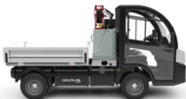
G4-07 COMBINED PICK-UP WITH 200L PRESSURE WASHER