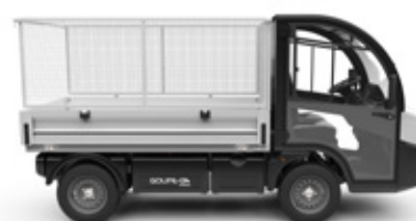
G4-03 PICK-UP CAGE BODY