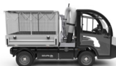
G4-09 COMBINED PICK-UP CAGE BODY WITH LEAF COLLECTOR