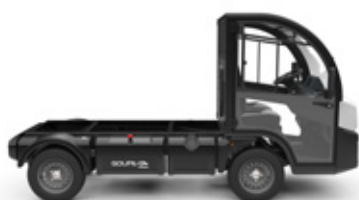
G4-01 CHASSIS CAB