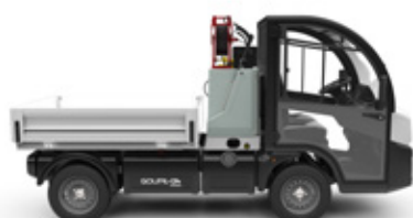
G4-07 COMBINED PICK-UP WITH 200L PRESSURE WASHER