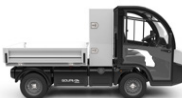
G4-08 COMBINED PICK-UP WITH TOOLBOX