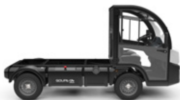
G4-01 CHASSIS CAB