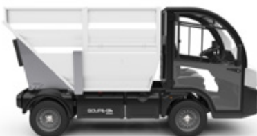
G4-11 HIGH TIP WASTE BODY