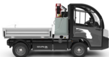
G4-07 COMBINED PICK-UP WITH 200L PRESSURE WASHER