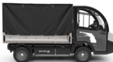
G4-05 PICK-UP PVC COVER