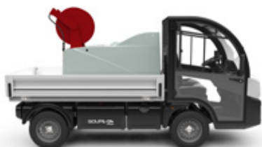
G4-10 PICK-UP WITH 500L PRESSURE WASHER