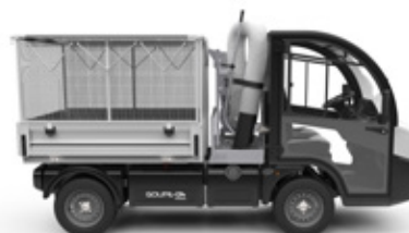
G4-09 COMBINED PICK-UP CAGE BODY WITH LEAF COLLECTOR