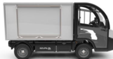
G4-06 VAN BODY