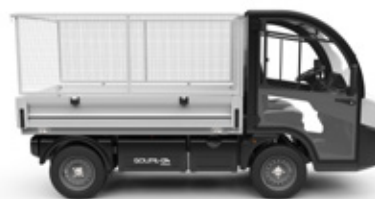
G4-03 PICK-UP CAGE BODY