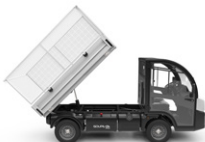
G4-04 PICK-UP CAGE TIPPER