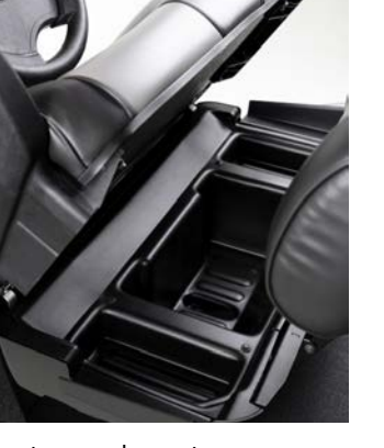
Front row under-seat storage tray with multiple compartments

This 6 passenger Personal Transportation Vehicle was specifically engineered with your comfort and safety in mind. And, with the warranty, backing, and support you expect from Club Car, your family can focus on what really matters.