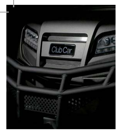
The new high-powered motor and electronic controller improves hill-climbing speed, performance, and efficiency.