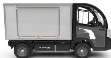
G4-06 VAN BODY