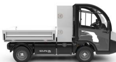
G4-08 COMBINED PICK-UP WITH TOOLBOX