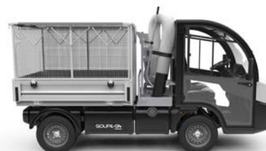
G4-09 COMBINED PICK-UP CAGE BODY WITH LEAF COLLECTOR