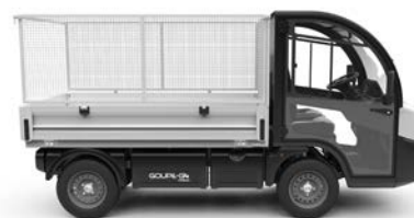
G4-03 PICK-UP CAGE BODY