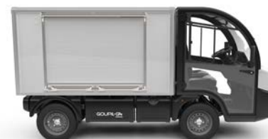
G4-06 VAN BODY