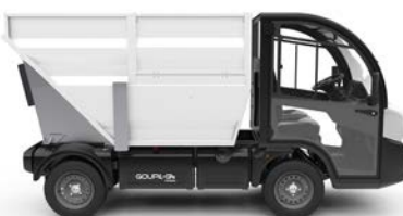
G4-11 HIGH TIP WASTE BODY