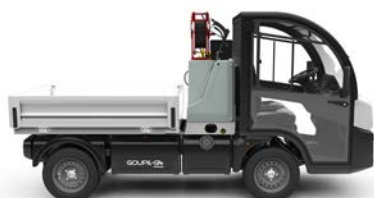
G4-07 COMBINED PICK-UP WITH 200L PRESSURE WASHER