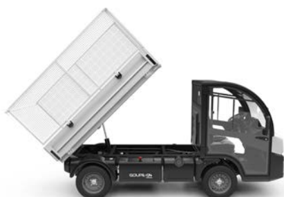
G4-04 PICK-UP CAGE TIPPER