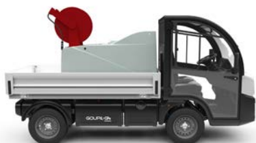
G4-10 PICK-UP WITH 500L PRESSURE WASHER