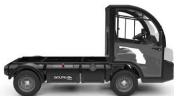
G4-01 CHASSIS CAB