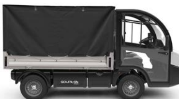
G4-05 PICK-UP PVC COVER